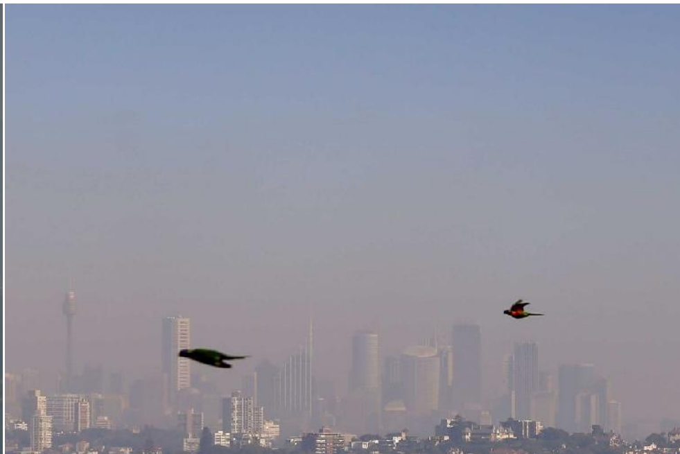
Hazard reduction burns on Sydney's outskirts have caused smoke to hang over the city for much of the day.