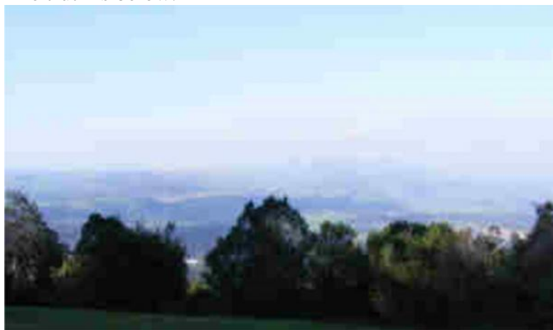
Smoke covers any landmarks