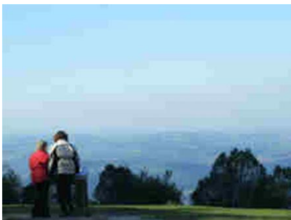
Tourists can not see for the smoke Image5.jpg (3.42 KiB)