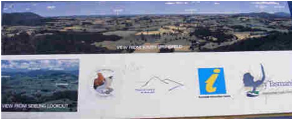
"Planned burn" had been added to the plaque. Someone had tried to scratch it off. Image4.jpg (7.76 KiB)