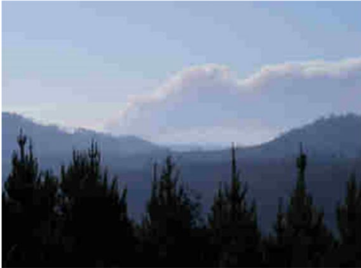
Image6.jpg (4.41 KiB)

The trip out of the North East is full of more outrage: