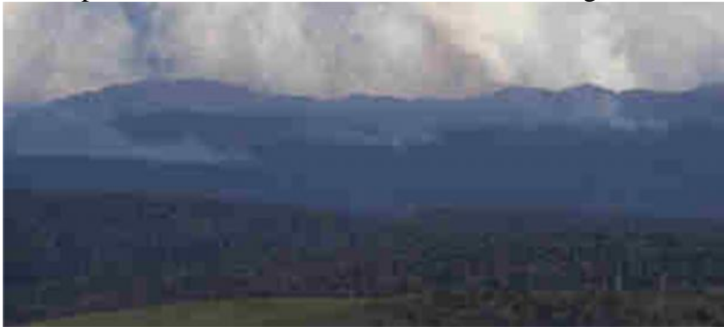
Mount Barrow planned burns

The trip out of the North East is full of more outrage: